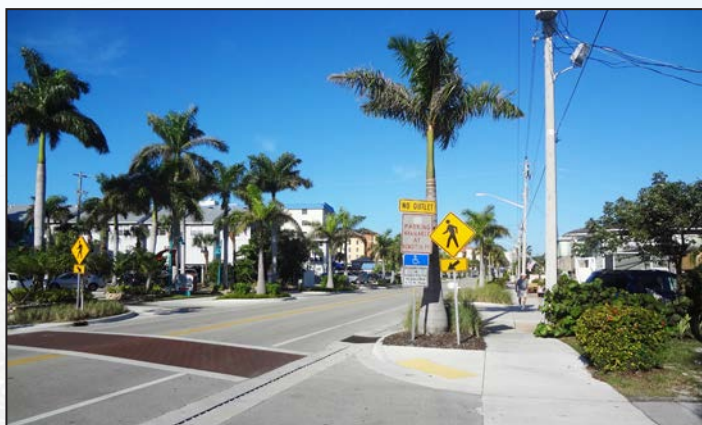
Estero Boulevard - North End

Since 2007, the Lee County Department of Transportation has been working with the Town of Fort Myers Beach to develop plans for the reconstruction of Estero Boulevard from Crescent Street to Big Carlos Pass. Earlier this year, preliminary design plans for six miles of Estero Boulevard were completed and presented to Town Council. Town Council agreed with Lee County to begin preparing final design plans for the first segment of the project beginning at Crescent Street and continuing approximately one mile south toward Lovers Lane. In June, the Lee County Board of County Commissioners approved a final design contract for this segment. Future phases of the project will reconstruct Estero Boulevard in approximately one-mile segments continuing to the south as funding becomes available. Construction of the first segment is expected to begin in early 2015.