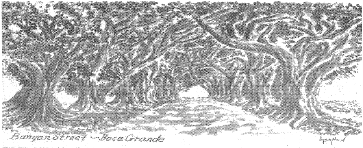
Photo from postcard art by Leo Patten, courtesy of Boca Grande Lighthouse Museum

Located in the beautiful historic district, Banyan Street is a signature icon on Gasparilla Island (Boca Grande). The graceful beauty of huge trees canopied tightly over a narrow street is truly village like. The fig trunks are nearly grotesque in form, twisting their way up and down. Large aerial roots drip down from above. Those roots that reach the ground add support to the heavy branches. This island street is a special place, worthy of attention and protection.