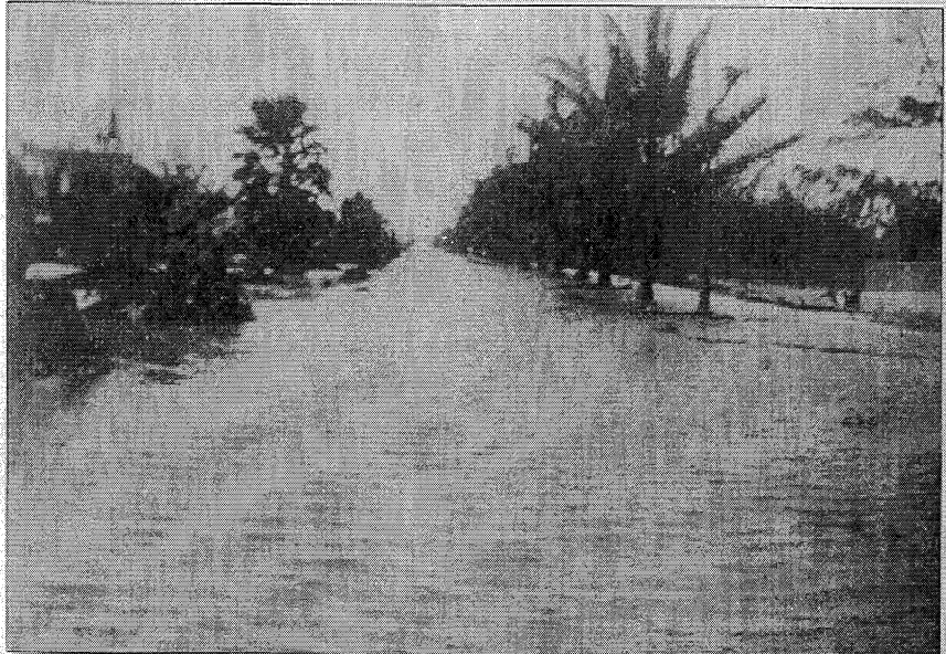
This downtown street, probably Gilchrist Avenue, flooded in the 1921 storm.

By existing 88 years, these trees have been exposed to no less than 4 hurricanes or tropical storms. Typical conditions of these tropical storm events that would have impacted these trees include high winds, Gulf of Mexico salt spray and salt water inundation from tidal flooding. This photo shows the flooding effects and ponded Gulf of Mexico water of the 1921 hurricane that hit Boca Grande.