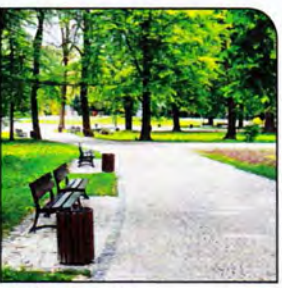
-Parks & Recreation