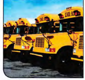
-Fleet Cleaning & Maintenance