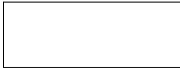
(Affix Corporate Seal, as applicable)

_____ Company Name (Name printed or typed)