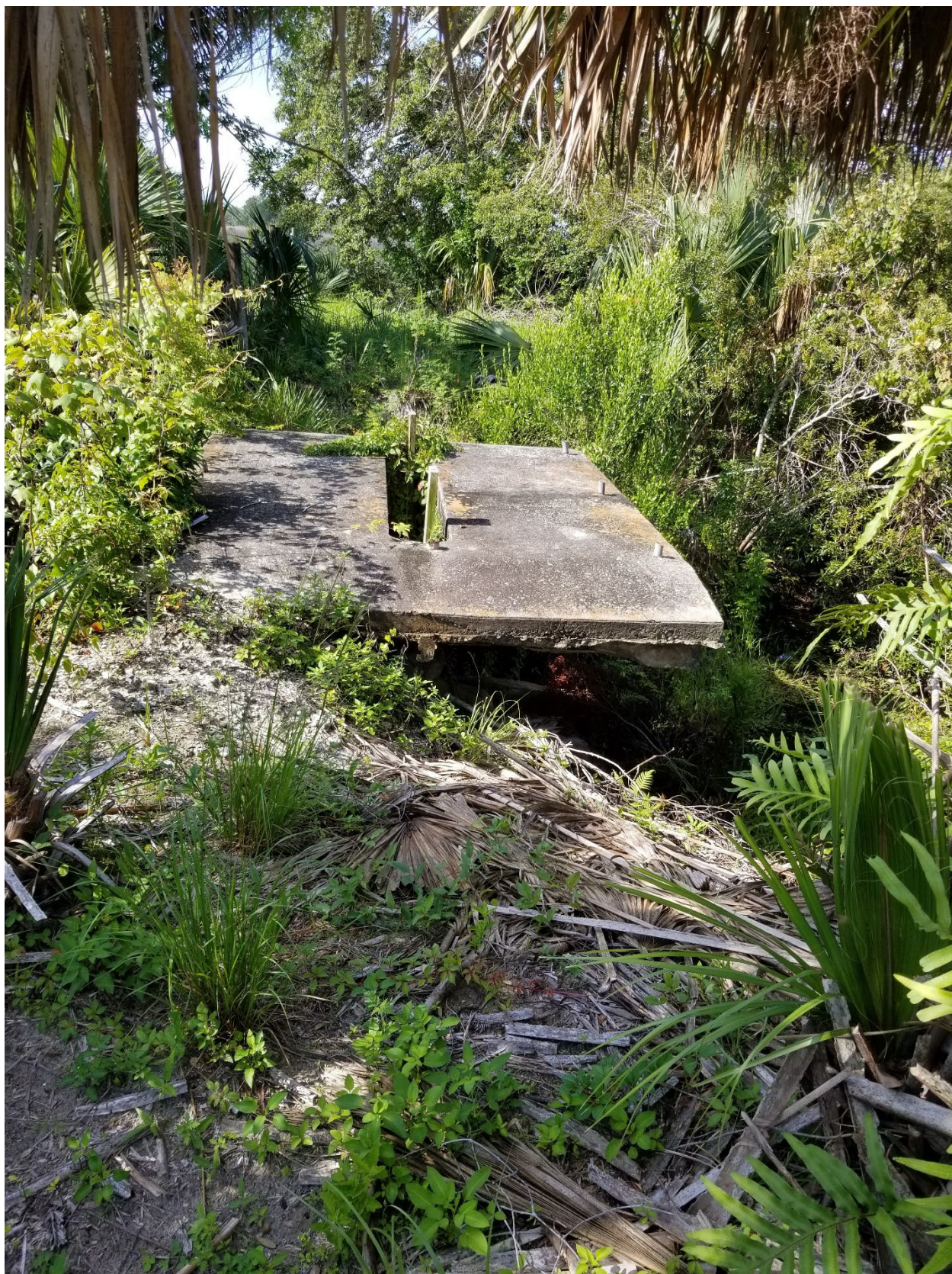
Figure 4: Photo taken of the south weir on 06-19-2018