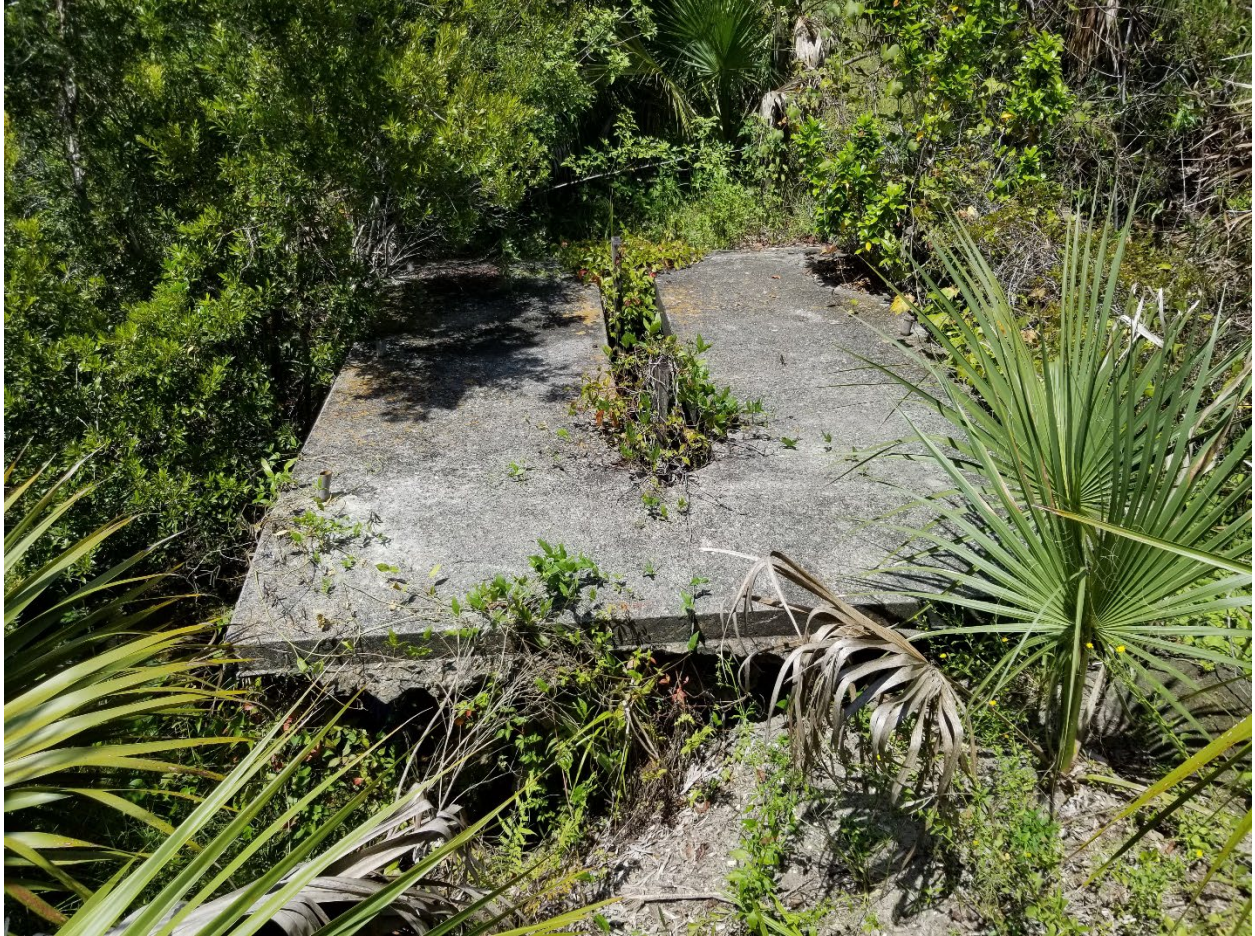
Figure 6: Photo taken of the south weir on 08-25-2023