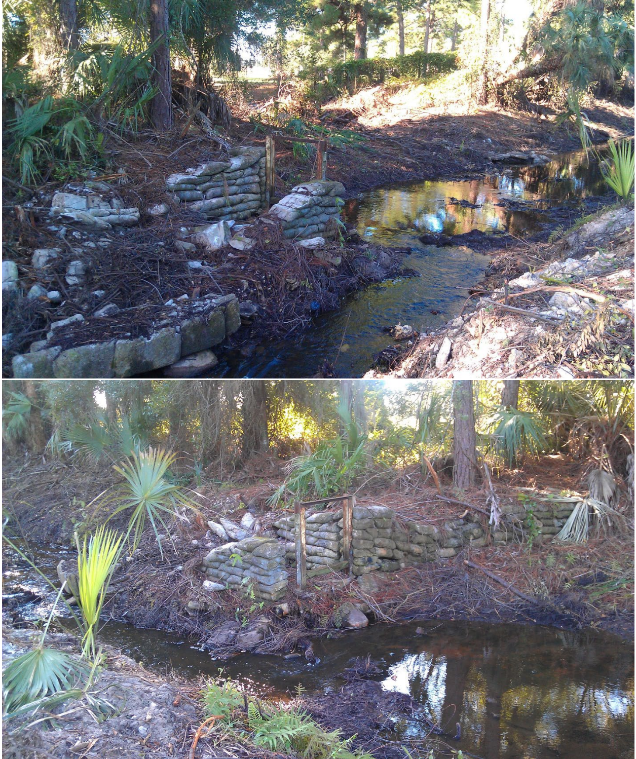
Figure 1: Photos taken of the north weir on 10-06-2011