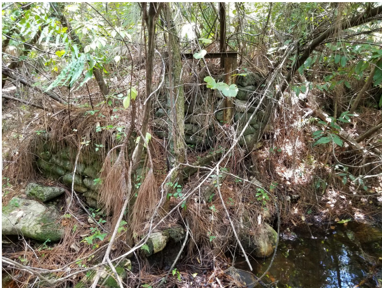
Figure 5: Photo taken of the north weir on 08-25-2023