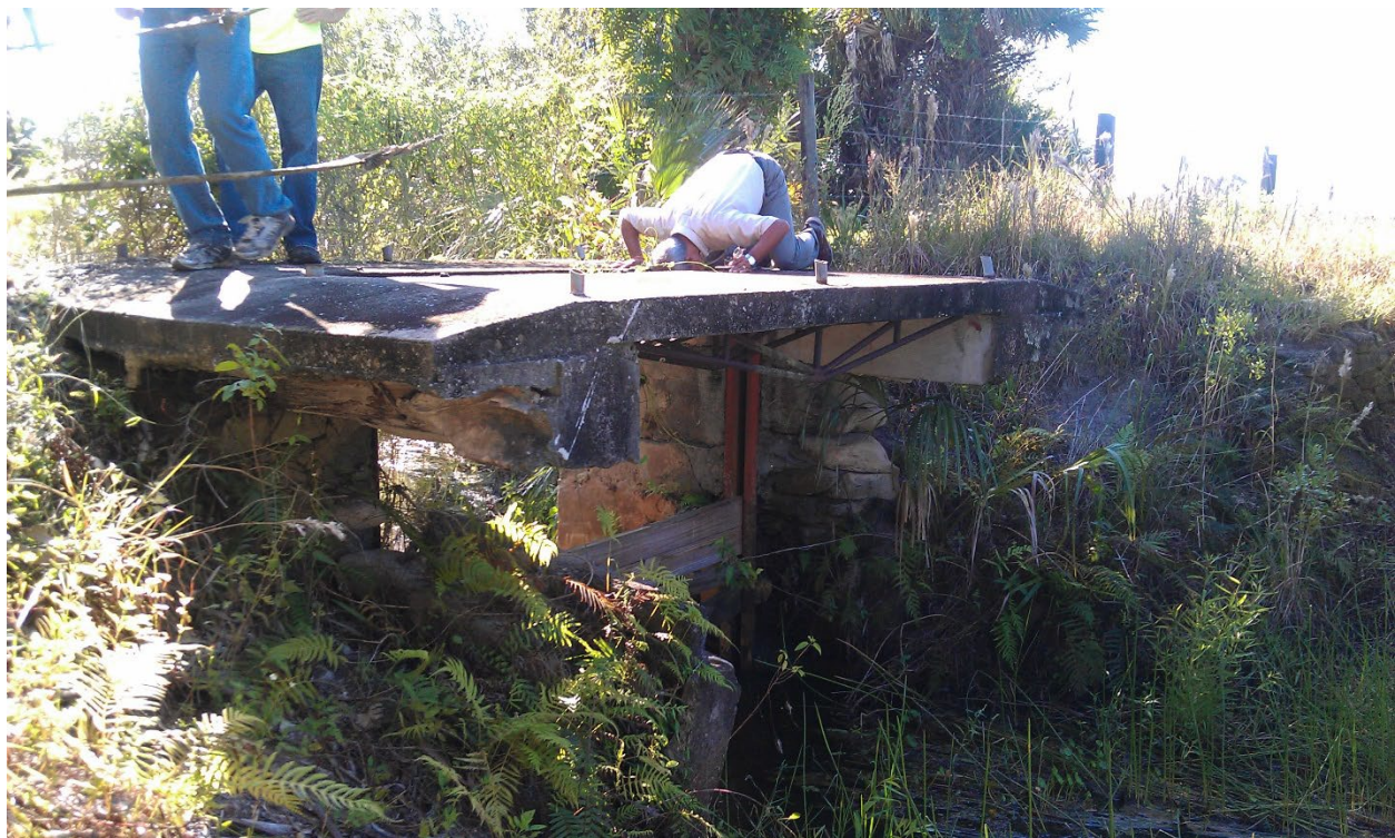
Figure 3: Photo taken of the south weir on 10-06-2011