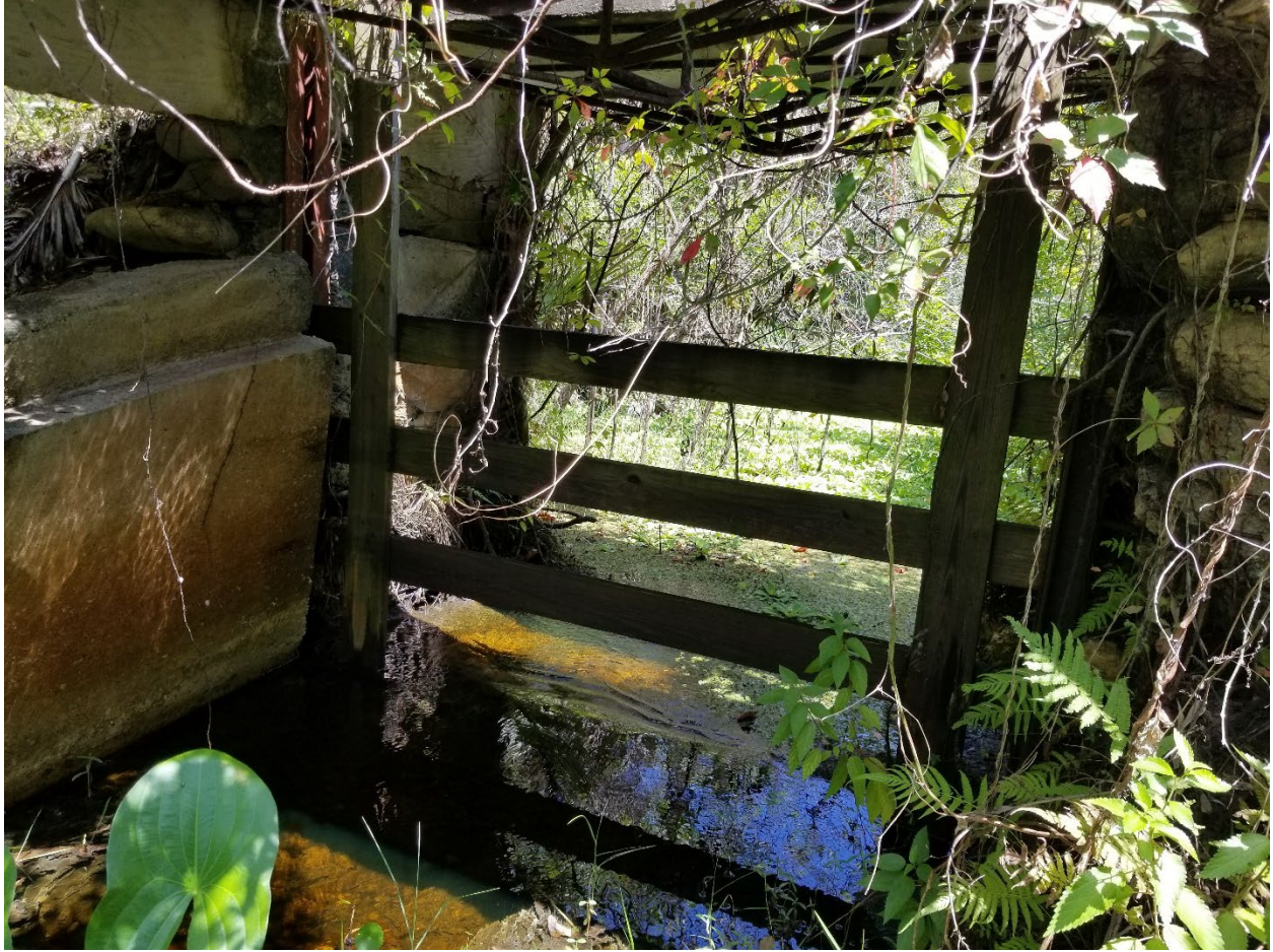
Figure 7: Photo taken of the south weir on 08-25-2023