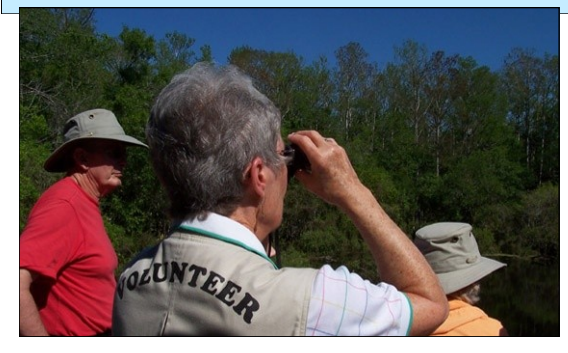
Volunteers around the trail answer questions and share wildlife sightings.

*Check-in begins 30 min. prior to walk at boardwalk entrance. Walks fill at 20 people (first-come, first-served).