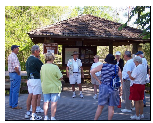
Join an experienced volunteer for a Guided Nature Walk