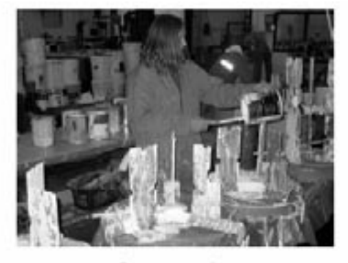
Being sorted ...