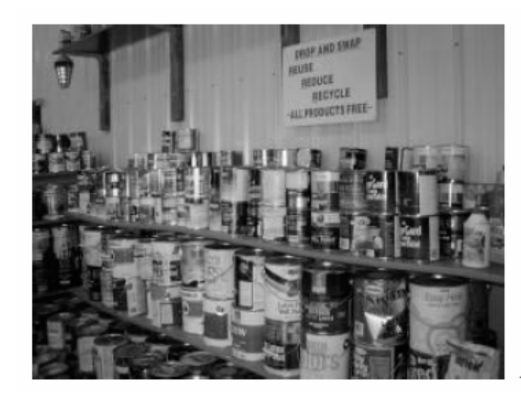
Larimer "Drop and Swap" shed.

Results : So far in 2005 9% of the total waste accepted has been given away in the Drop n' Swap program compared to 5% in 1996. It has resulted in an approximate savings of 27% to the program, not to mention a great form of advertising. There has been a significant increase in residents participating in the give back program. It is truly a win, win situation. The majority of the waste collected from residents is non-hazardous/latex paint. Latex paint is the most sought out item that is given back to the public. Many organizations have utilized paint for different community projects and teachers as well have taken advantage of paint for class room assignments.