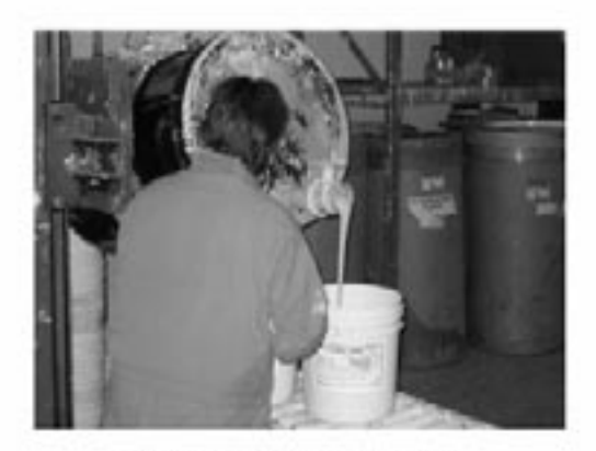
Filling into new containers...