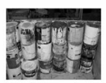
Paint as received ...

Description : The population of Snohomish County, WA is primarily rural. Paint is collected at the main county collection facility four days a week and occasionally (depending on funding) at a couple of mobile collection events in the more rural areas of the county. Paint is accepted from residents, blended, and then placed in four gallon containers for use. Colors available include interior/exterior white, brown, green, gray and tan. Exterior use is recommended for all the colors except interior white. Once containerized, the paint is taken to the salvage store located next to the facility. The public can take up to 32 gallons of paint free from the reuse store. This program has been operating for over 10 years. Prior to opening the Moderate Risk Waste (MRW) Facility the latex salvage program operated as part of a series of mobile Household Hazardous Waste (HHW) collection events sponsored by the County.