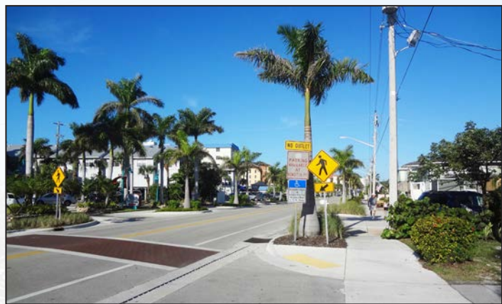
Estero Boulevard - North End

Since 2007, the Lee County Department of Transportation has been working with the Town of Fort Myers Beach to develop plans for the reconstruction of Estero Boulevard from Crescent Street to Big Carlos Pass. Earlier this year, preliminary design plans for six miles of Estero Boulevard were completed and presented to Town Council. Town Council agreed with Lee County to begin preparing final design plans for the first segment of the project beginning at Crescent Street and continuing approximately one mile south toward Lovers Lane. In June, the Lee County Board of County Commissioners approved a final design contract for this segment. Future phases of the project will reconstruct Estero Boulevard in approximately one-mile segments continuing to the south as funding becomes available. Construction of the first segment is expected to begin in early 2015.