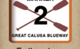
Trail markers Selected markers shown

Accessible Public Land County sites State sites