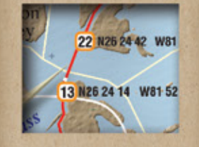
Trail marker GPS coordinates