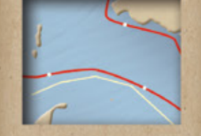
Estimated mile marks