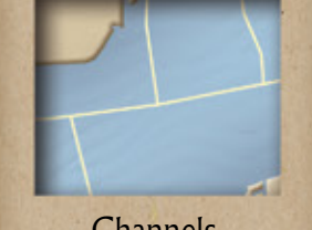
Channels Major boating channels