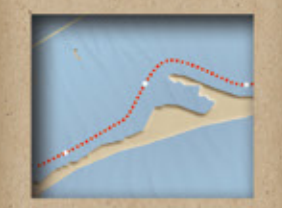
Advanced paddlers No trail markers