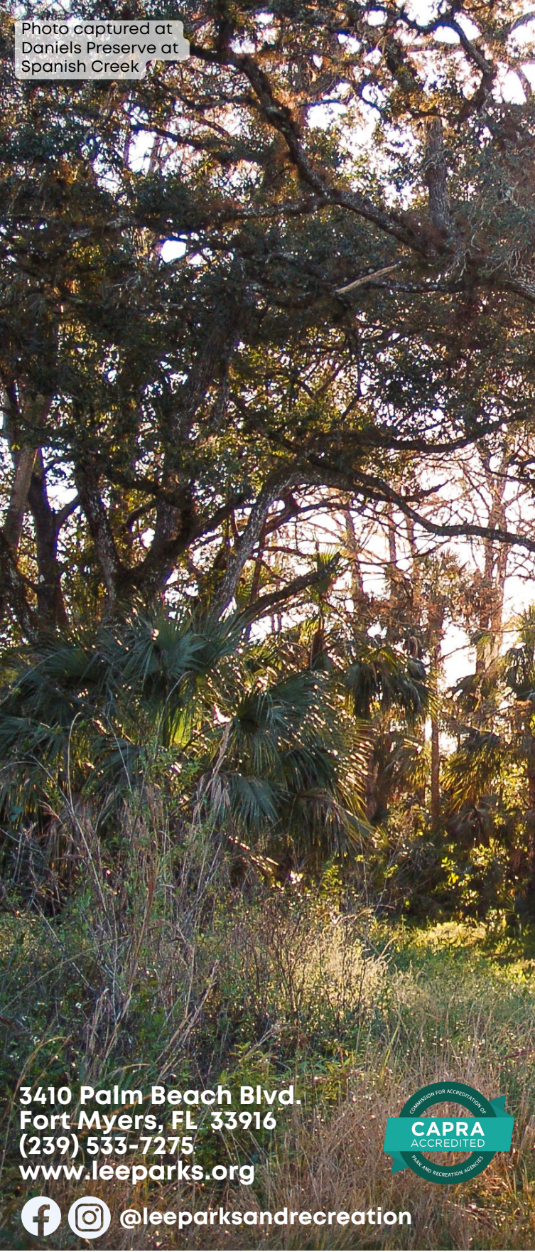
Photo captured at Daniels Preserve at Spanish Creek

jetBlue Park and Lee County Sports Complex www.leeparks.org/sports Our parks are home to spring training for the Boston Red Sox and the Minnesota Twins.