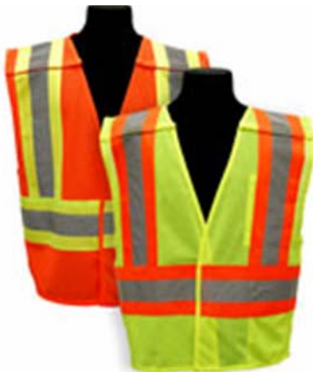
Class 2 Safety Vest