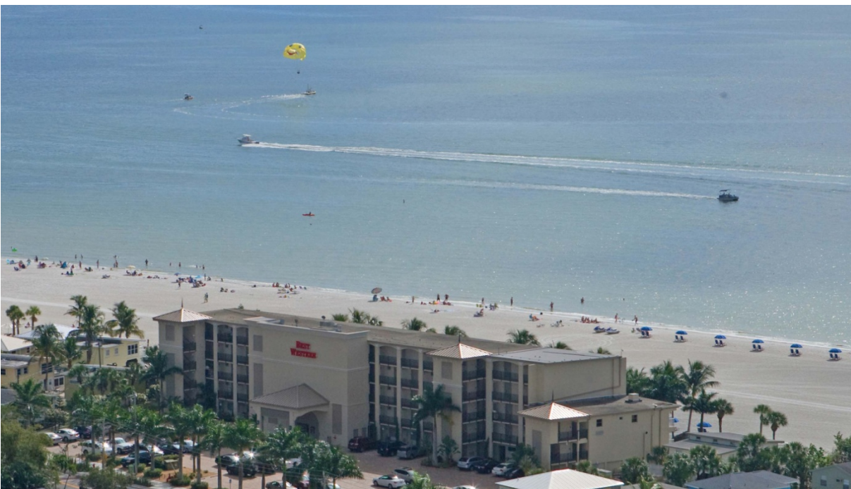
Nov 22 – Completed Beach fill near the Best Western Plus Beach Resort