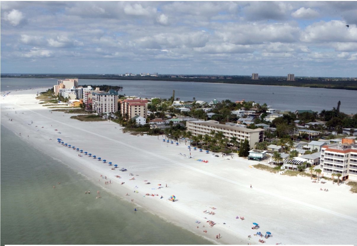
Nov 22 – Completed Beach fill near the Best Western Plus Beach Resort