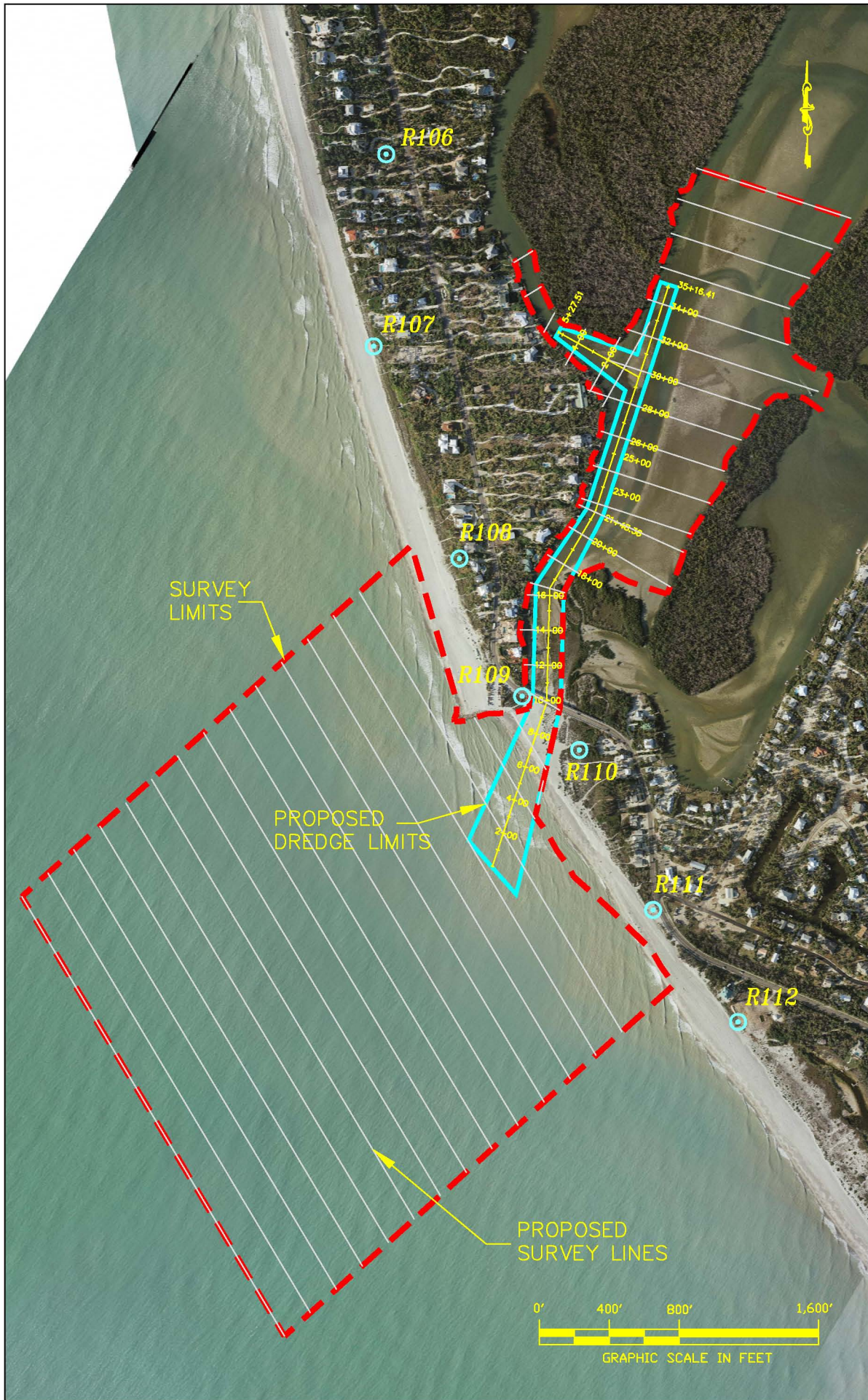
FIGURE 1 BLIND PASS RESTORATION PHYSICAL MONITORING PLAN BATHYMETRIC SURVEY PLAN VIEW

TITLE: NATURAL RESOURCES DIV 1500 Monroe St. Fort Myers, Florida 33901 Ph. (239) 533-8109/10 Fax. (239) 486-8408