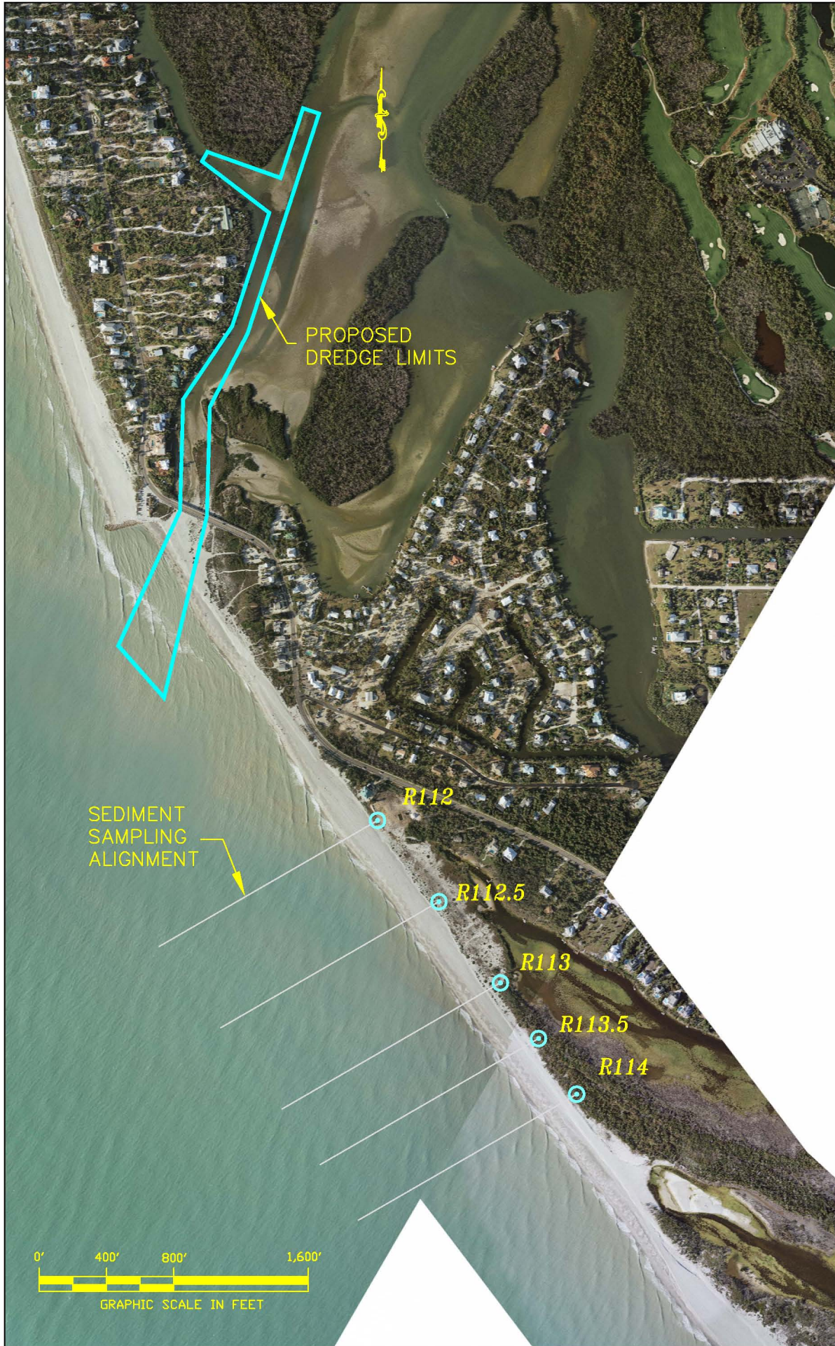
FIGURE 3 BLIND PASS RESTORATION PHYSICAL MONITORING PLAN SEDIMENT SAMPLING PLAN