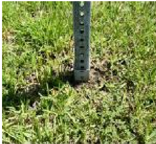
Typical Sleeve with Post construction