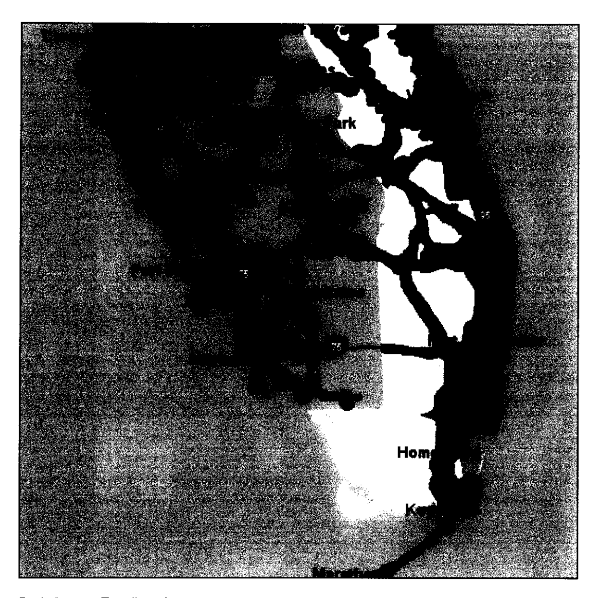
Dark Green - Excellent Coverage Green - Good Coverage Light Green - Average Coverage White - No Coverage

The following pages are basic coverage maps of the state of Florida. They are generic in nature. We would be glad to have a formal meeting in which we could review our actual Network Maps with the County. These maps would provide a more detailed overview of our coverage area.