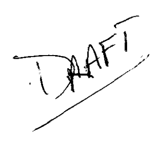
Exhibit B Lee Expansion Project Man hour Billing Rates* April 8, 2004