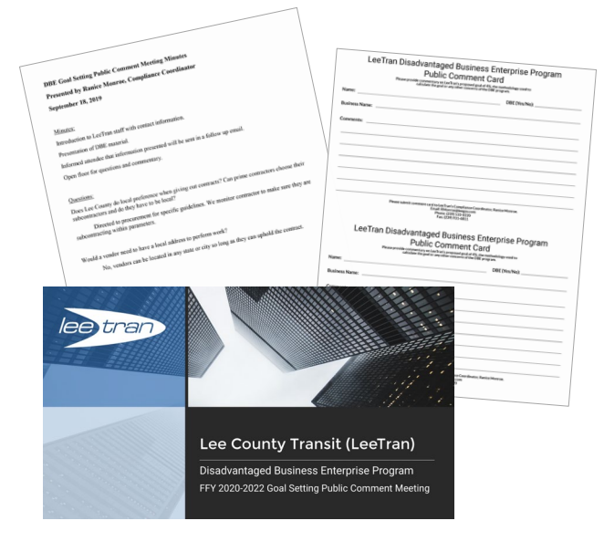
Figure 3: LeeTran DBE Goal Public Meeting, September 18, 2019

Based on the discussions that occurred during the public outreach activities, no comments were received regarding modification of the four percent (4%) goal for FFYs 2020–2022.