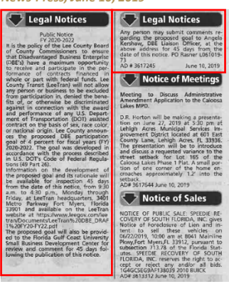
Figure 1: LeeTran DBE Goal Advertisement, News-Press, June 10, 2019